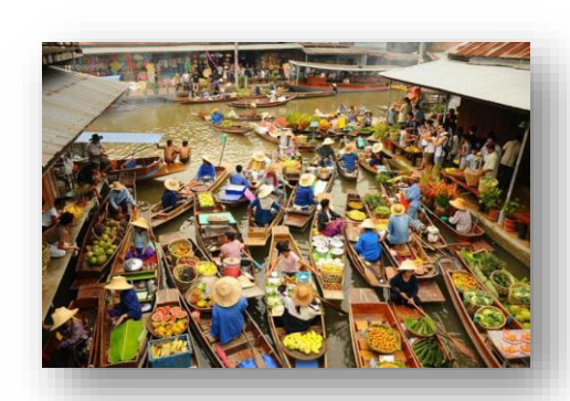
Cai Rang floating market

Walking trip to visit the fruit plantation and local noodle factory.